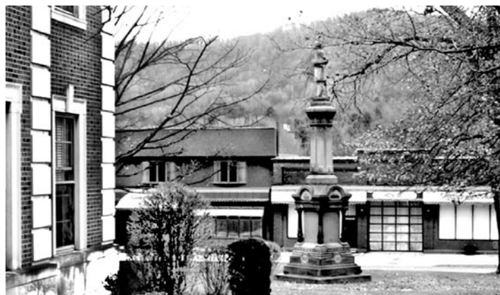
Today's Courtyard Restaurant, 505 W. Main rests on the location of the Bennett House Hotel.