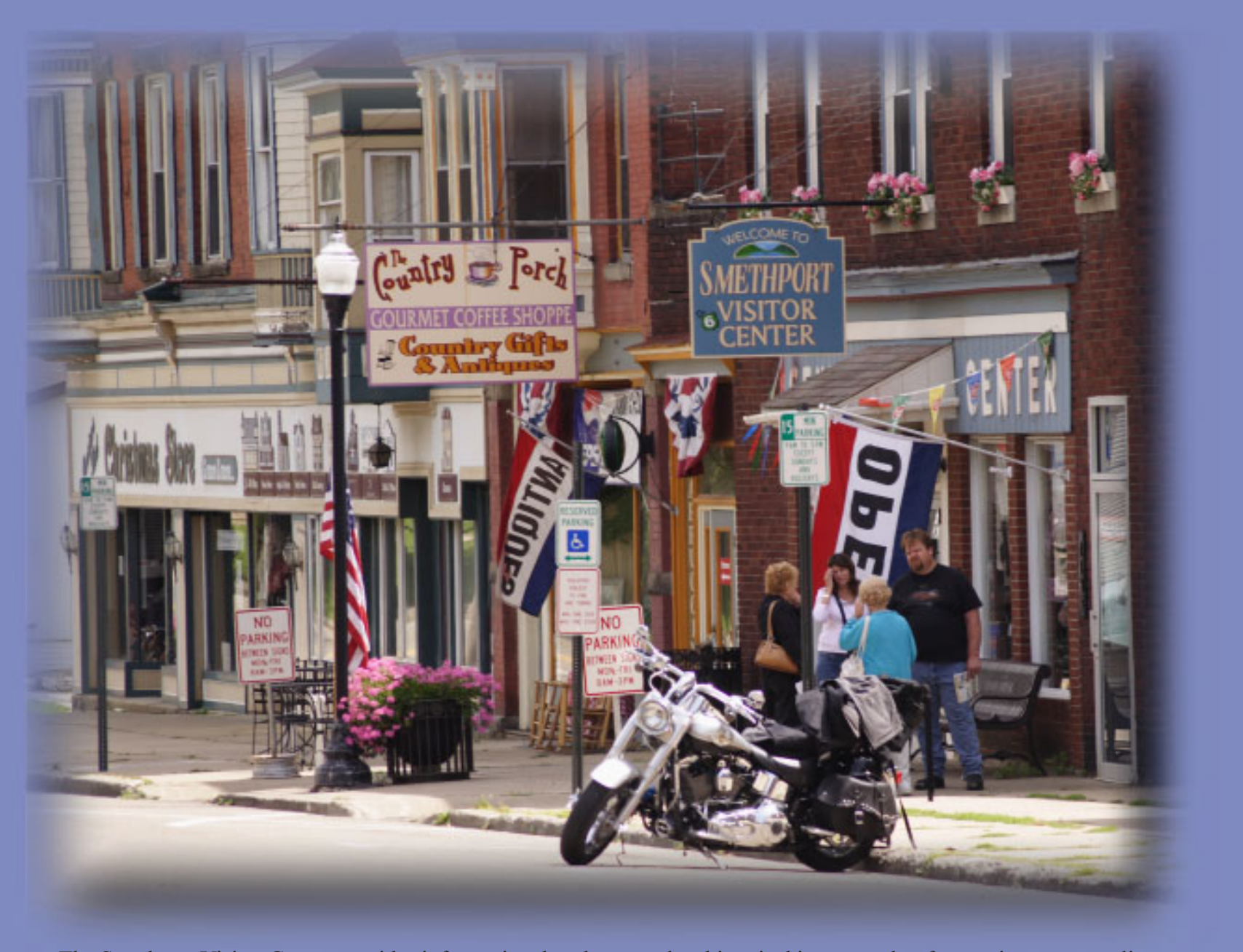
The Smethport Visitor Center provides information, brochures and an historical ice cream bar for passing motorcyclist.