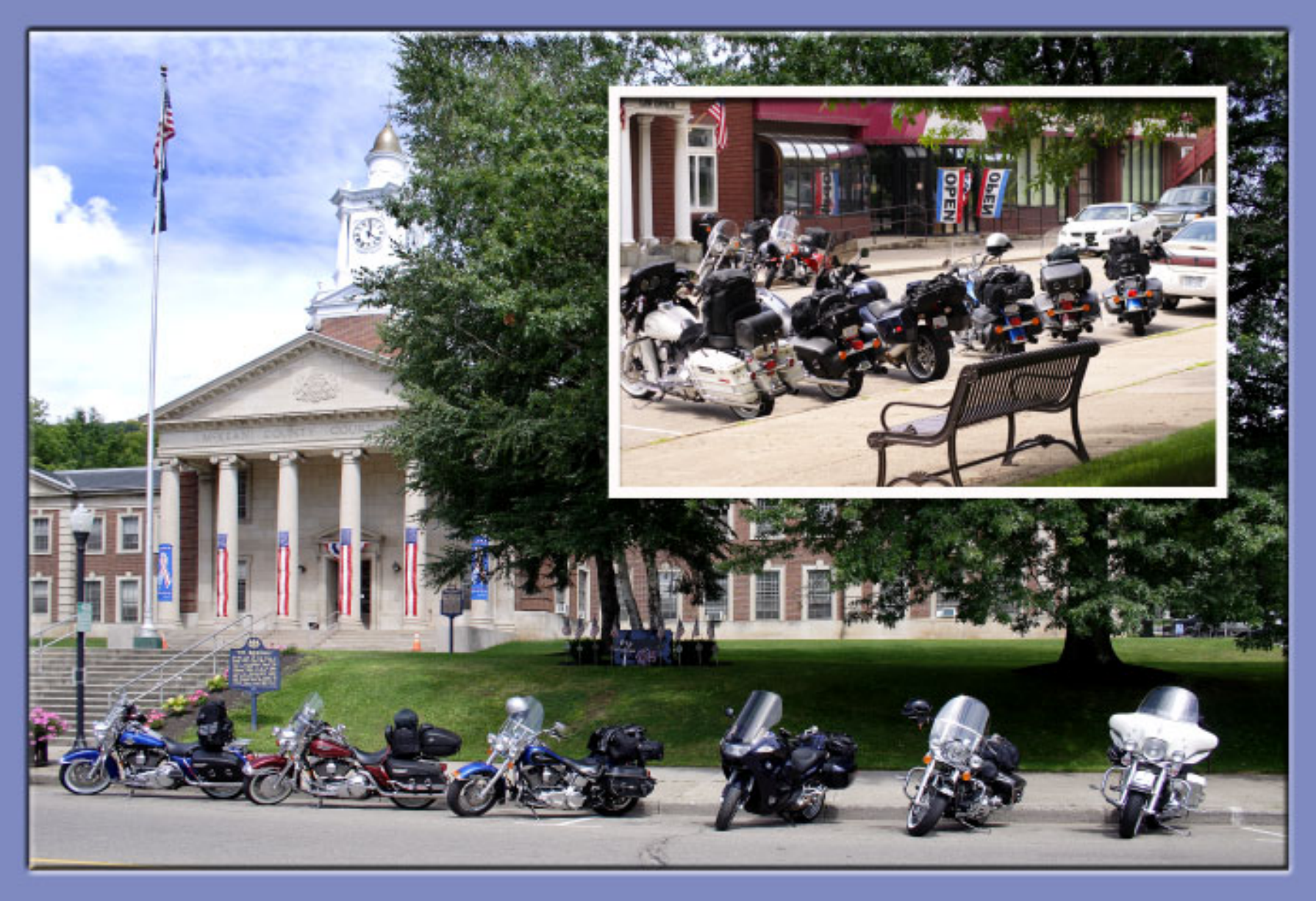
The McKean County Courthouse offers an attractive backdrop for cyclists eating at a downtown restaurant.