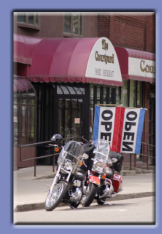
Cycle enthusiasts can find several fine restaurants in Smethport's Business District